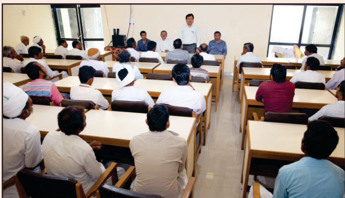
Training to farmers of Amreli