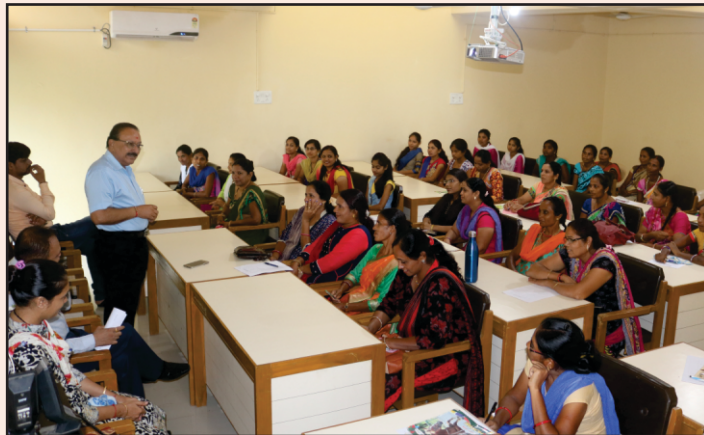
Training for the farm women of Tapi