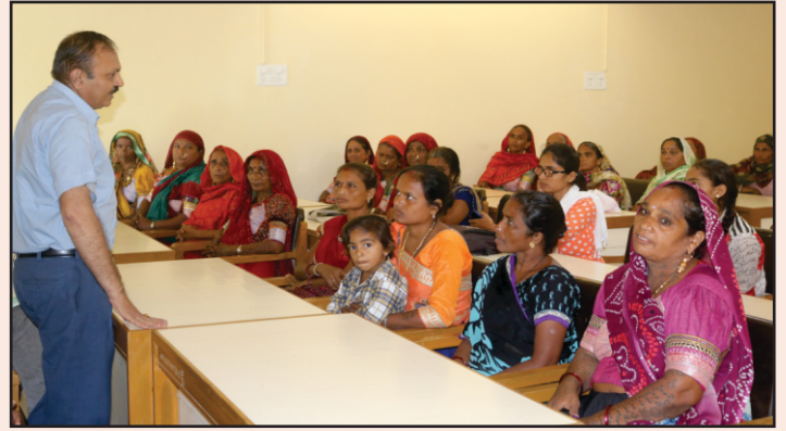
Training to farm women of Gir-Somnath