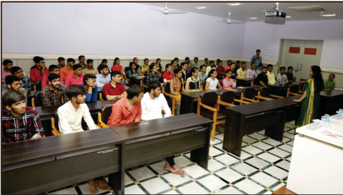
Participant's interaction and learning