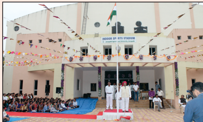
Independence Day Celebration at JAU