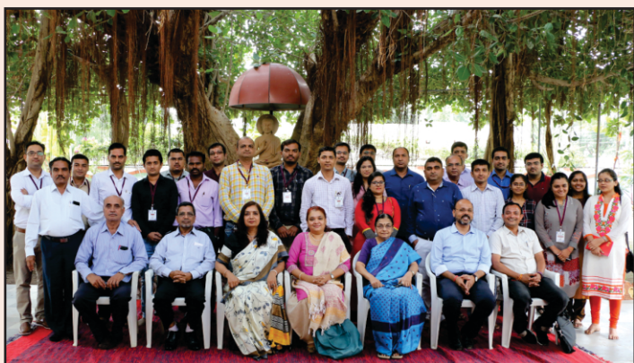
Participants of National Workshop

Department of Biotechnology had organized a three days workshop on “Transgenic Trait Detection in Crop” sponsored by Gujarat State Biotechnology Mission, Department of Science and Technology, Gandhinagar from 24 th September to 26 th September, 2018. The workshop had hands-on training for the detection of transgenic trait using various methods. The workshop was attended by the faculties of different colleges and university from Gujarat. The resource person included eminent scientist from ICAR-National Bureau of Plant Genetic Resources, New Delhi; Mahyco Seeds; National Agri-Food Biotechnology Institute, Mohali; National Law School of India University, Bangalore and Navsari Agricultural University.