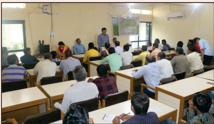
Training for the farmers of Bhuj-Kutch