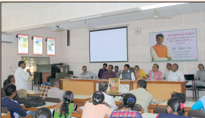
Hon'ble Union Minister, Shri Mansukhbhai Mandavia interacting with farmers

Hon'ble Union Minister of Road Transport and Highways, Shipping, Chemical and Fertilizers, Government of India, Shri Mansukhbhai Mandavia visited our Krishi Vigyan Kendra, Targhadia on September 25, 2018. He visited plant health clinic laboratory, museum, crop cafeteria, soil and water testing laboratory, breeder seed production units, etc. and interacted with farmers and KVK scientists regarding different ways and chances for disseminating the advanced agricultural technology for increasing the crop production.