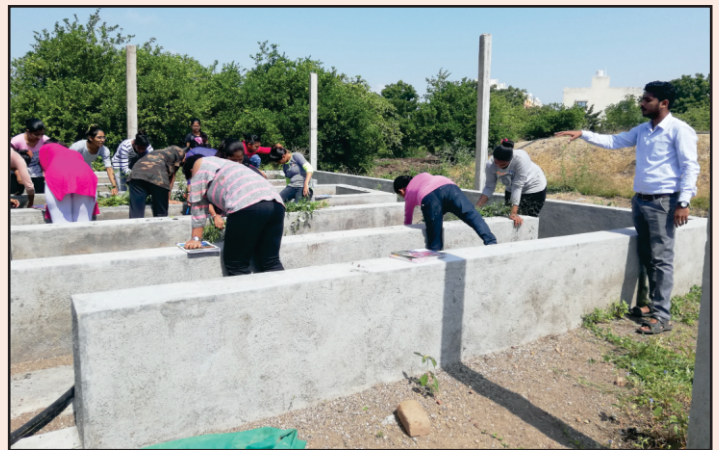
Community building the compost pits, where organic matter decomposes in the form of manure