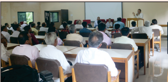
Training to farmer of Amreli