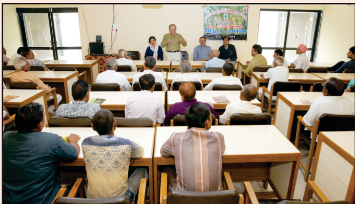
Training to farmers of Ahmedabad at JAU