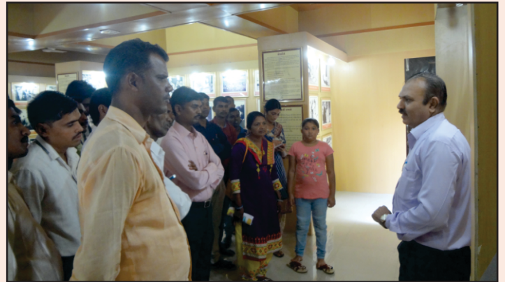
Training to farmers of Dahod