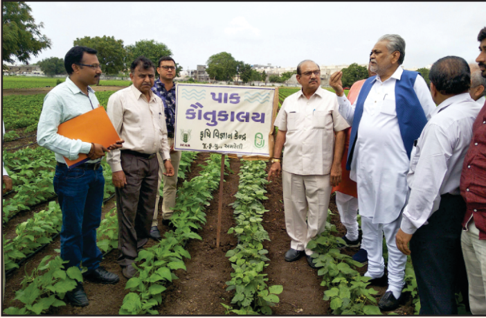
Hon'ble Union Minister visiting Crop Cafeteria of KVK, Amreli

Hon'ble Union Minister of State for Agriculture and Panchayati Raj, Government of India, Shri Parshottambhai Rupala visited Krishi Vigyan Kendra, Amreli on August 13, 2018. He visited crop cafeteria and inspected activities of KVK. He appealed the farmers and farm-women to adopt the advanced technology by seeing in the crop cafeteria. He also appreciated the efforts of scientists in developing the crop cafeteria.