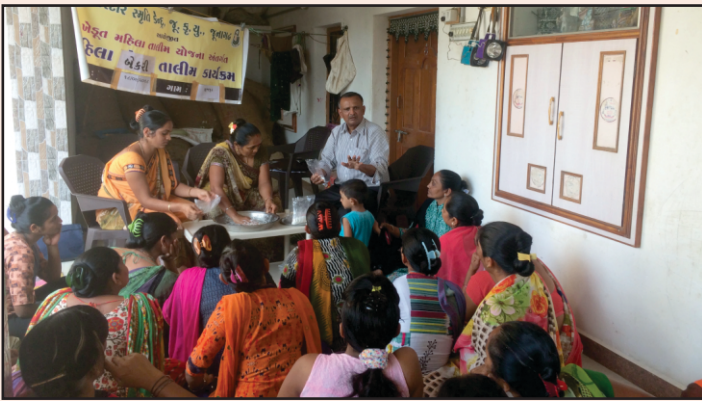
Training to women of Saragvada and Shukhapur village by SSK, Junagadh