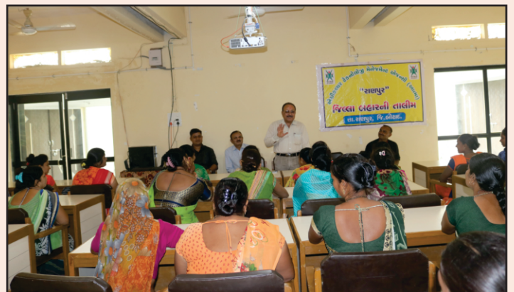
Training to farm women of Botad