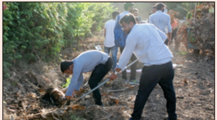
Student cleaning the hostel surroundings

PG Institute of Agri-Business Management, JAU, Junagadh has celebrated the 150 th Jayanti of Mahatma Gandhi by organizing different activities i.e., a special lecture on Mahatma Gandhi, Swachhata Abhiyan , hostel room cleanliness competition etc. Staff and students had actively participated during celebration of all the activities.