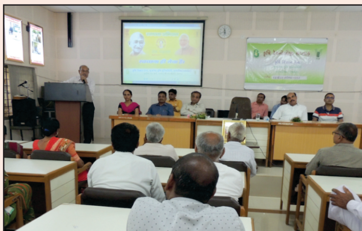
Dr. A.R. Pathak, Hon'ble Vice Chancellor, JAU, Junagadh addressing the farmers

Total 602 farmers got knowledge about improved crop cultivation practices of different crops grown in dry farming, selection of variety, demonstration on soil moisture conservation technology, high-tech production of crops, scientific management of different disease, feeding, breeding and scientific management of animals, balance use of chemical fertilizer and organic farming, judicious use of insecticide and pesticide, practical demonstration of various improved agriculture implements, etc. on 17-21, September 2018 at KVK, JAU, Targhadia.