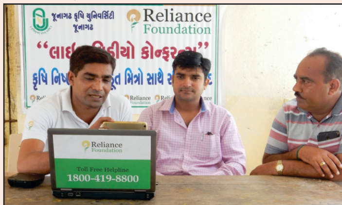
Interaction with farmers by scientists