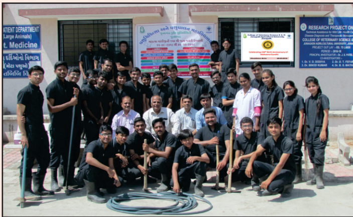
Staff and student participated in the program cleanliness drive