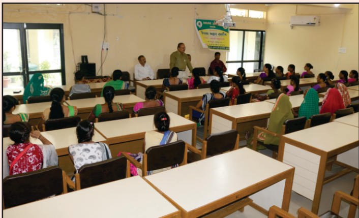
Training to farm women of Anand