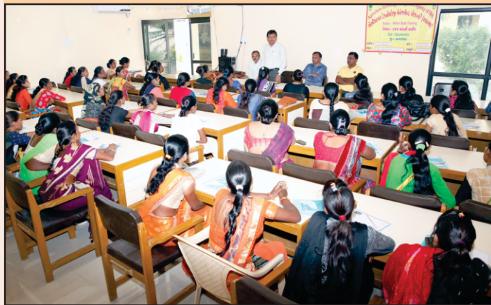
Training for the farm women of Khedbrahma