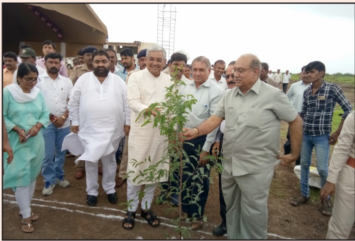
Planting of trees by Hon'ble Minister and others