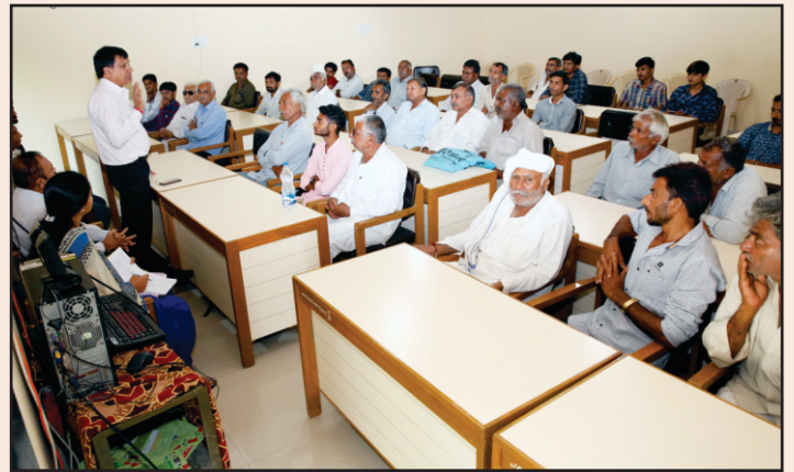
Training to farmers of Porbandar