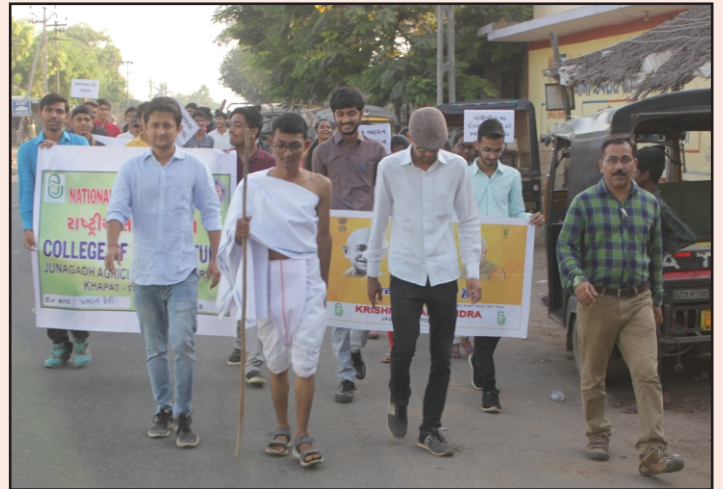
Celebrating 150 th Mahatma Gandhi Jayanti through a rally ( Prabhat Pheri )

College Agriculture, JAU, Khapat celebrated 150 th Mahatma Gandhi Jayanti by organizing a rally ( Prabhat Pheri ) on 2 nd October, 2018 from Khapat to Porbandar. Students have also performed Nukkad Natak on Swatch Bharat Mission at different places of Porbandar. College has organized debate, essay and drawing competition on September 26-27, 2018.