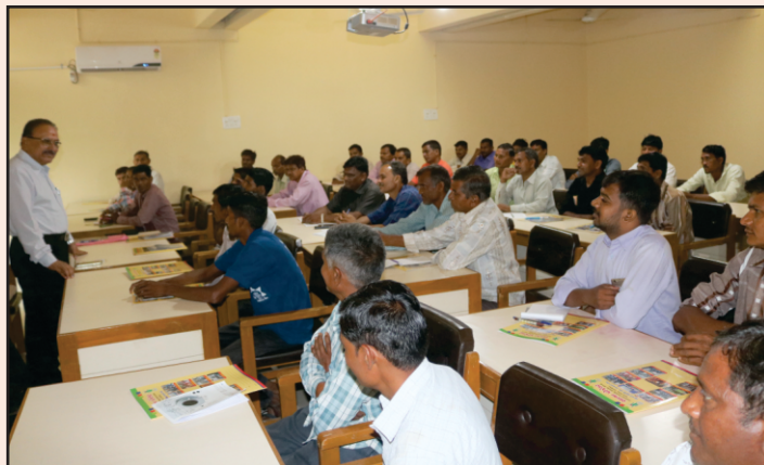
Training for the farmers of Chhota Udepur