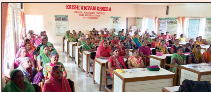
Live Telecast of Hon'ble Prime Minister

Eighty-eight farmers and farmwomen were participated with SHGs farmers and share their experience about new technologies in agriculture on July 12, 2018 at KVK, JAU, Nana Khandhasar. The farmers and farmwomen interestingly participated in live telecast of Hon'ble Prime Minister's speech on “Doubling the Farmer's Income by 2022”.